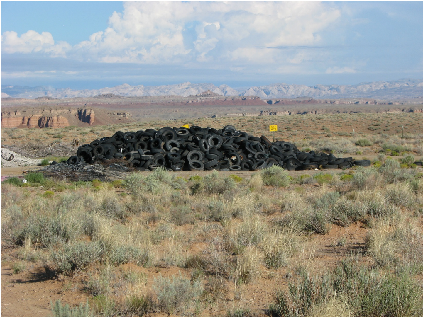
Looking northwest at the tire pile