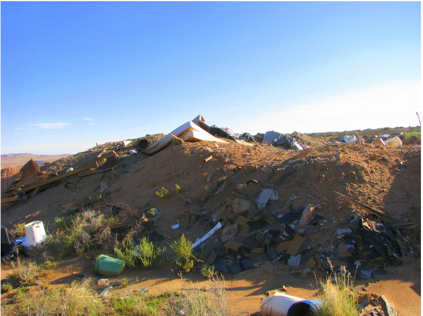
Working face of the landfill, several mattresses were placed into the waste cell. These need to be separated out of the waste stream and once per year trucked to the Wayne County Class II landfill for disposal.