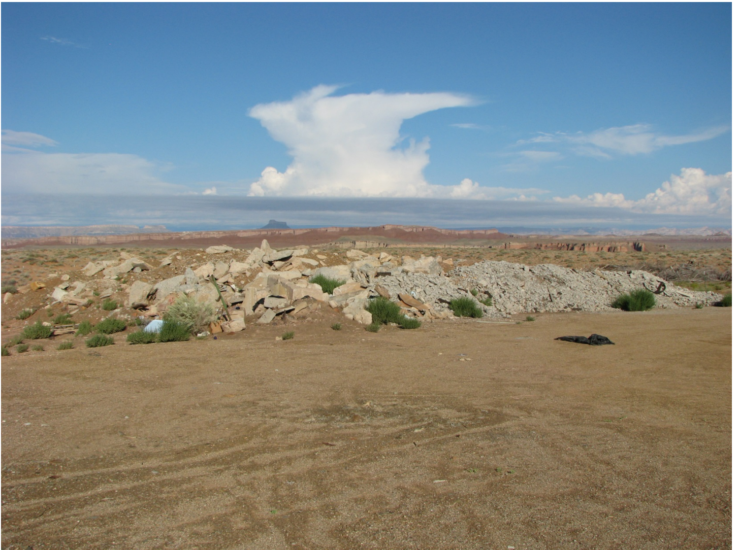
Inert waste pile