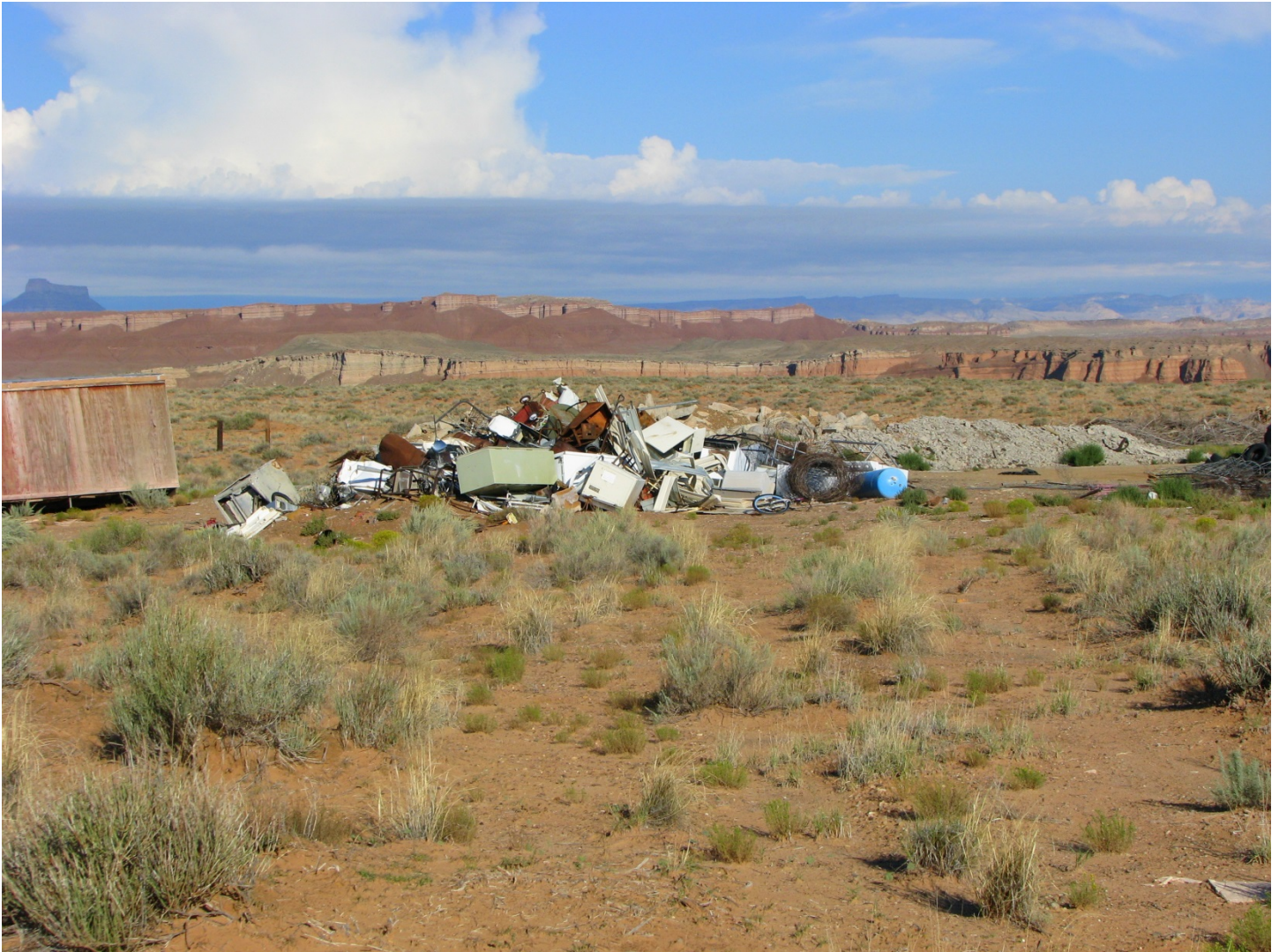
Looking northwest at the recyclable materials pile