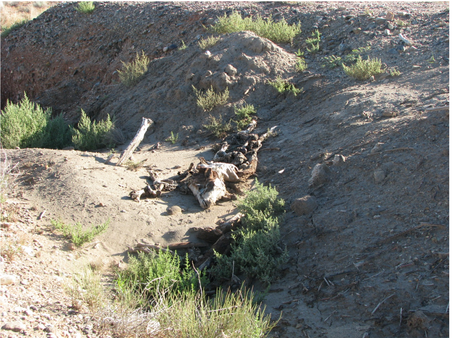
Dead animal trench, this cow was not covered when added to the trench. The animals need to be covered as soon as possible so wild animals are not attracted to the landfill.