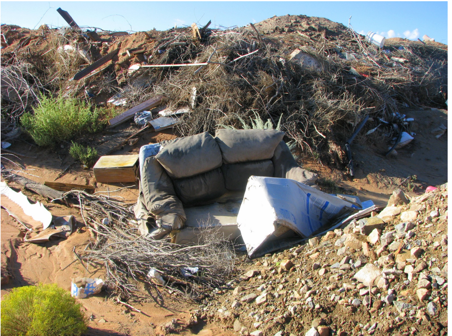
The working face of the landfill