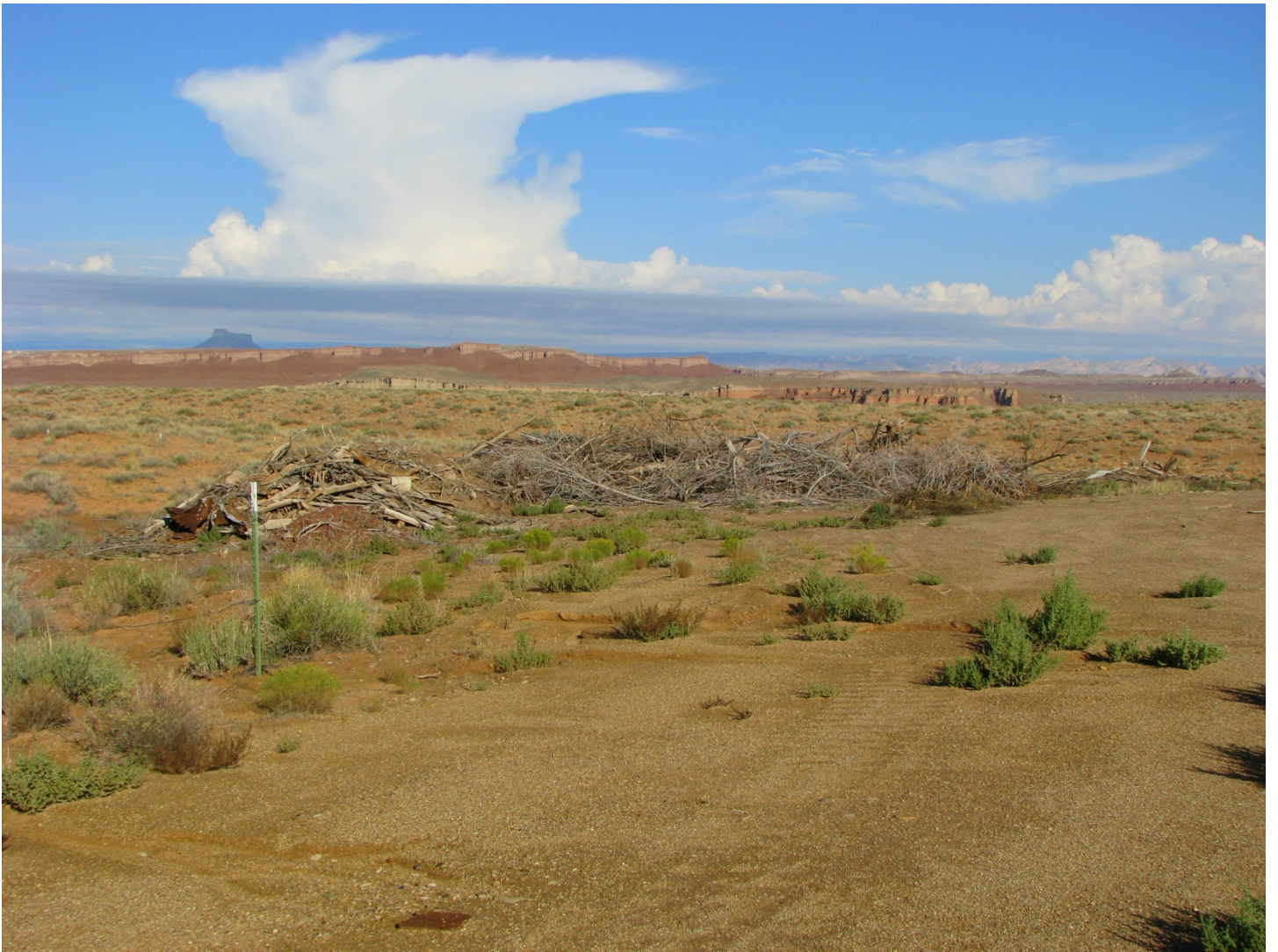
Green waste pile