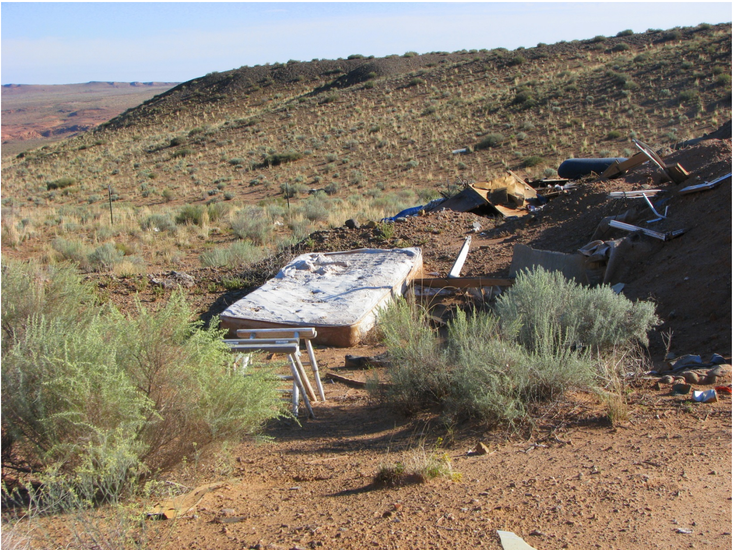
Another mattress that needs to be disposed of at the Class II landfill near Loa